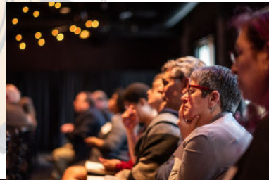
Biannual member meeting at Michigan Opera Theater