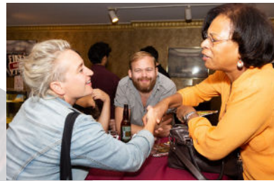
Creators of Culture Celebration