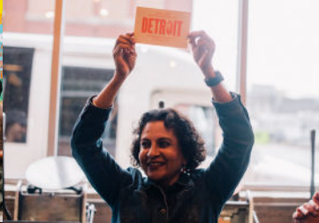
CulturePop, sponsored by Quicken Loans Community Fund