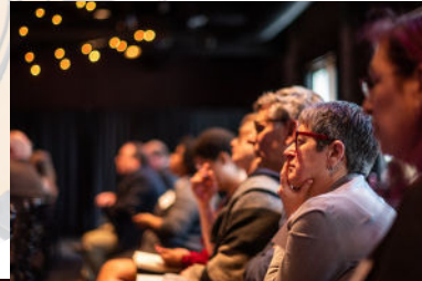
Biannual member meeting at Michigan Opera Theater