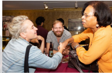
Creators of Culture Celebration